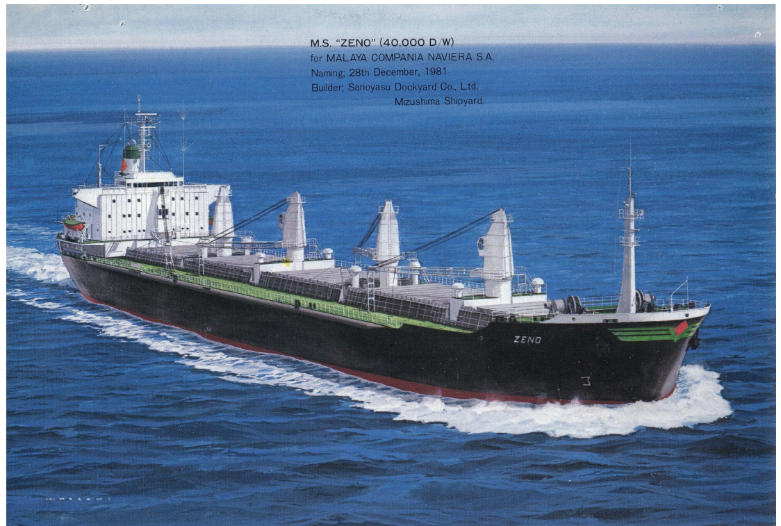
M.S. "ZENO" (40,000 D/W) for MALAYA COMPANIA NAVIERA S.A. Naming; 28th December, 1981 Builder; Sanoyasu Dockyard Co., Ltd. Mizushima Shipyard.